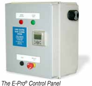
The E-Pro® Control Panel