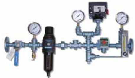
The MaxPro™ SG Air Control Unit

The air supply hose has a safety swing coupling to ensure a secure connection between actuator and gas supply, while helping to prevent kinks or tangles in the hose. The length of the air supply hose assembly is custom made at time of order.