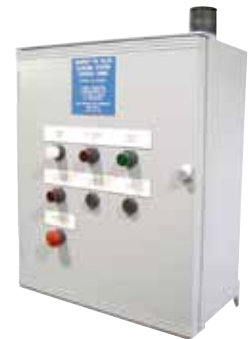
The MaxPro™ SG Control Panel

Powell Valve Closure System Control Panels are listed by Underwriters Laboratory to UL 508A for Enclosed Industrial Control Panels. Panels are listed by Underwriters Laboratory bearing the UL & CUL mark for use in the United States and Canada markets. In applications where a CSA listed control panel in Canada is required, please contact Powell for further information.