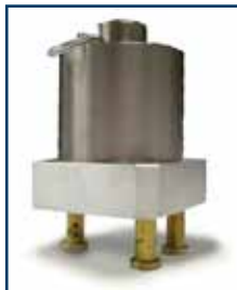
Torque Limiting non-sparking 5-spoke Valve Adapter