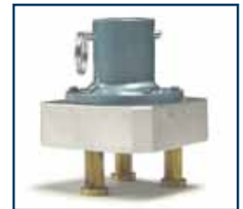
High Torque non-sparking 5-spoke Valve Adapter