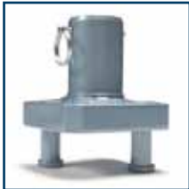
High Torque, 4 Spoke Valve Adapter

The following valve adapters are available for use with the UniPro™ Standard Valve Closure System.