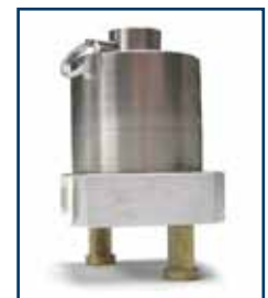
Torque Limiting non-sparking 4-spoke Valve Adapter

UniPro™ Pneumatic Valve Closure Systems are engineered, designed, and field-tested to ensure reliable performance while reducing installation time, maintenance, and material cost. That's Reliable Engineering.