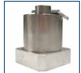
Torque Limiting Valve Adapter (Only for Chlorine Valve)